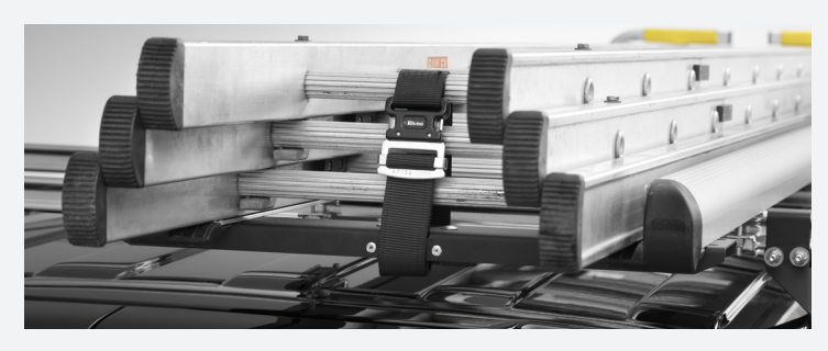
Adjustable strap and buckle Fixing ladder in place at the rear