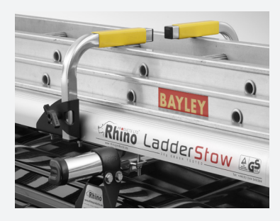
Adjustable guide post Adjustable height for different ladder types